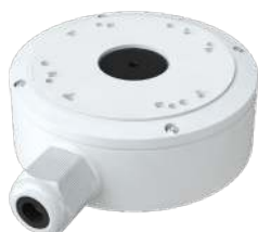
PR-JBA14IP66 Large Water-proof Junction Box