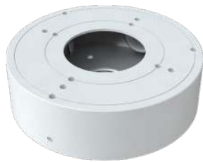
PR-JB14IP64 Large Junction Box