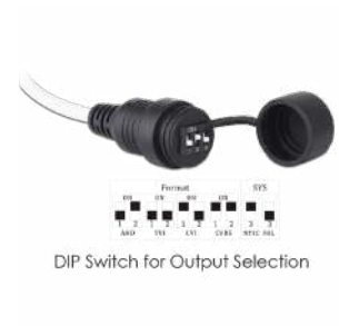
DIP Switch for Output Selection