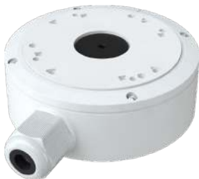
PR-JB14IP66 Large Water-proof Junction Box