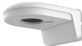
PR-WB-A Designed Wall Bracket