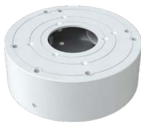
PR-JB12IP64 Small Junction Box