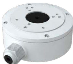
PR-JB12IP66 Small Water-proof Junction Box